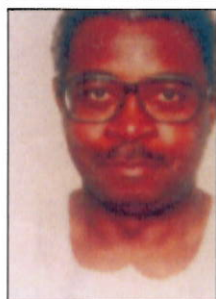
• General T Y Danjuma (Rtd) GCON, Founder